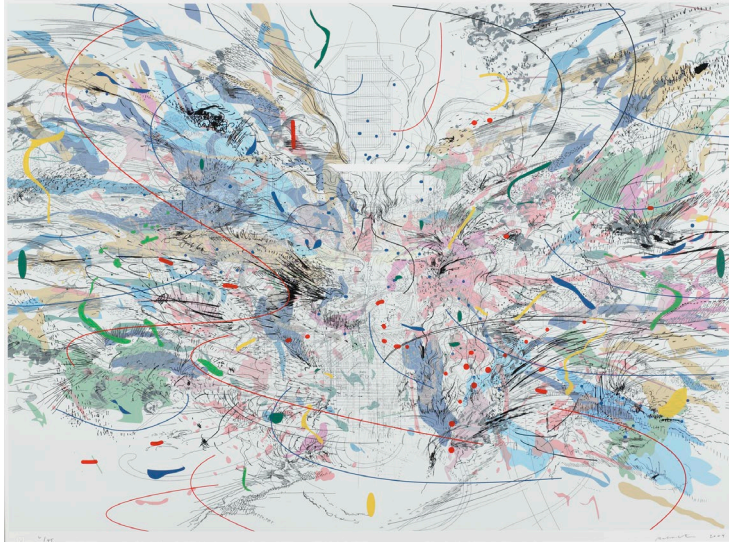
Julie Mehretu, American (born Ethiopia), 1970 Entropia (review) , 2004. Color screenprint and lithograph on wove paper; edition of 45, plus 6 artist's proofs 29 × 40 in. (73.66 × 101.6 cm) (image); 33 1/2 × 44 in. (85.09 × 111.76 cm) (sheet) Highpoint Editions Archive, The Friends of Bruce B. Dayton Acquisition Fund and the Christina N. and Swan J. Turnblad Memorial Fund, 2020.85.68

Minneapolis Institute of Art 2400 Third Avenue South Minneapolis, MN 55404 artsmia.org