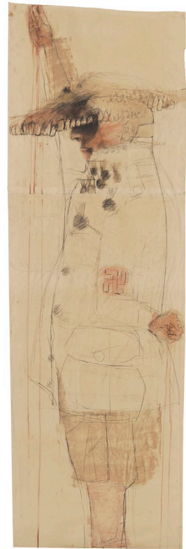
Right: Mauricio Lasansky, No. 5, 1961-66, "The Nazi Drawings," Levitt Foundation