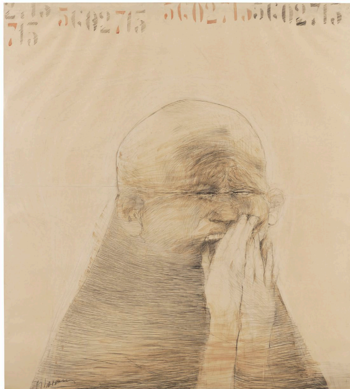
Left: Mauricio Lasansky, No. 24, 1961-66, "The Nazi Drawings," Levitt Foundation